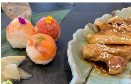
Teriyaki Chicken + 3 Temari

(Choice of California, Spicy Tuna, or Shrimp Tempura)